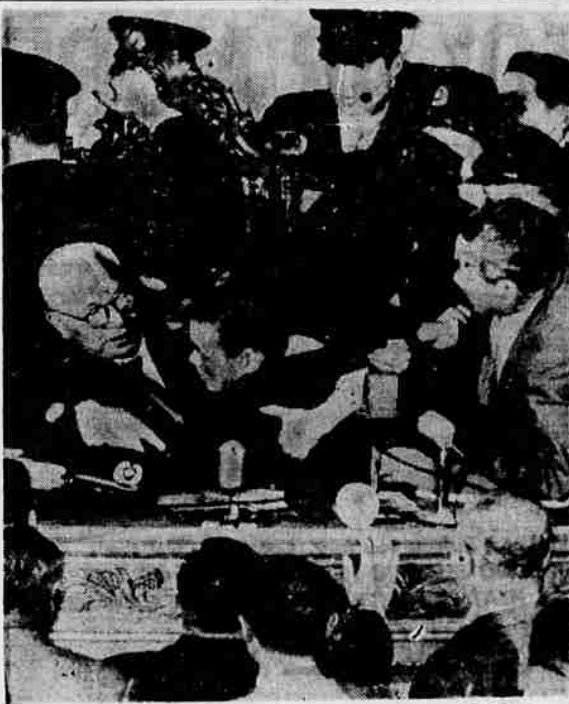
RIOT IN THE DIET —Upper House President Tsuruhei Matsuno (seated) has an unidentified Diet guard in his lap as guards seek to protect him from rampaging Socialists. The Upper House of the Diet in Tokyo "became an arena for a common dogfight and plunged the entire nation into a mire of disgrace," according to reports from Japan. The riot took place when Socialist Saburo Eda (not shown) refused to stop filibustering and Diet guards, on the order of President Matsuno, sought to evict him.

The decision followed a conference with the Civil Air Patrol, Airport Commission and Columbia Timing Assn.