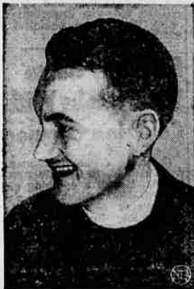
PRIEST IN THE FAMILY —Avery Dulles, 37, the youngest son of Secretary of State and Mrs. John Foster Dulles, will be ordained a Jesuit priest on June 16th by Francis Cardinal Spellman at Fordham University, New York City. Young Dulles entered a Jesuit novitiate in 1946 and has been studying for the priesthood since that time.

Remember not to use a scatter rug at the head or foot of the stairs, or on stair landings. At these points tripping over, or slipping on a scatter rug may mean serious injury.