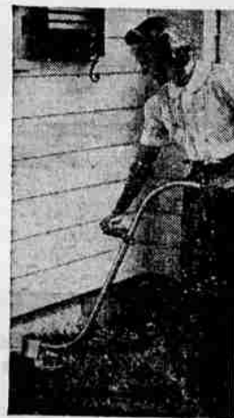
DESIGNED for the homeowner who is tired of the time-consuming, back-breaking task of trimming his lawn, is this electrically-operated grass cutter. It is ideal for trimming grass along walk, driveway and flower beds.

You can keep the finish on your aluminum door and window frames bright by covering with two thin coats of fresh, white shellac.