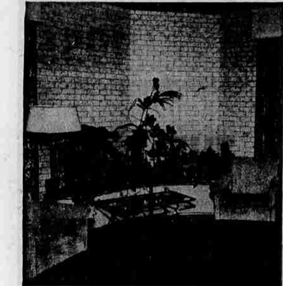
GARDEN ROOM —All the charm of a garden room is caught in the mood of this handsome, brick-patterned wall paper. A planter box and terracette furniture further enhance the "outdoors" look.

The modern bath provides a sharp contrast to its older counterpart. Twin fixtures, separate compartments, regular and junior-sized equipment, plus good lighting and ventilation have brought imagination and color into bathroom planning.