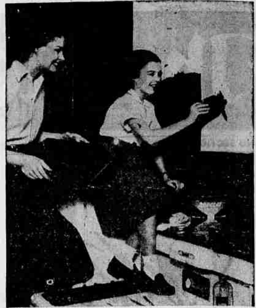
A TWO-GAL TEAM such as this one can easily install the new tileboard in a kitchen, laundry or bathroom. The board comes in 12 colors, in 16" by 16" squares and are easily aligned by a special patented lock-strip divider. The tileboard cannot crack or peel, and cleans easily with a damp cloth.

Plan now to do one of these easy-do-it-yourself projects. Don't be afraid to be original and don't worry about making mistakes. The real pleasure and satisfaction of any project is in its creation.