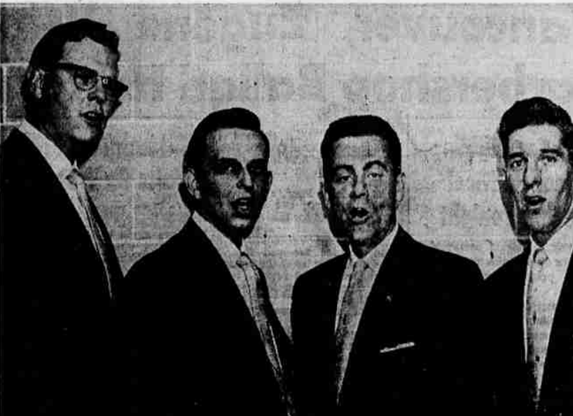
ALTERNATE QUARTET — The Foregonians of Portland, who organized again recently to take part in the Northwest Regional contest in Roseburg Saturday, were named as alternates (third place) here. They will represent the region if one of the top two quartets finds it impossible to attend the international contest next month. Also see story, pictures Page 1.