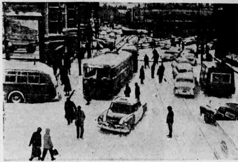
STOPPED COLD! —This is an early morning scene in Boston as commuters took to their walking shoes in an effort to get to work. Buses, cars and trucks here are stalled and no traffic was moving due to severe northeast blizzard which swept over New England. Many passengers slept overnight in the busses pictured above.

For Dependable Repairs On All Makes Of Washers & Dryers BERGH'S APPLIANCE