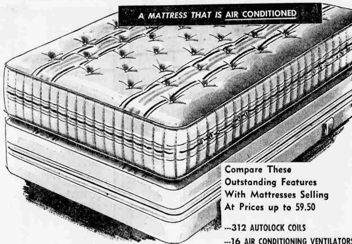
A MATTRESS THAT IS AIR CONDITIONED

Compare These Outstanding Features With Mattresses Selling At Prices up to 59.50