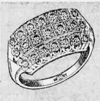
The "Astrid" 15-Diamond 14-K Gold Wedding Band

An exquisitely designed ring. 14-k gold mounting.