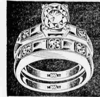
"Tosca" Bridal Pair With Large Solitaire

Both rings hand carved of 14-karat gold. At only