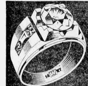
The "Executive" Man's Diamond Set Gold Ring

Large diamond in hand-carved gold mounting.