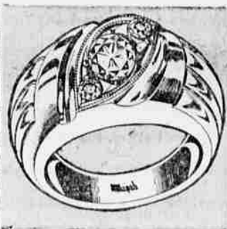
Man's "Mizpah" Diamond 14-Karat Gold Mounting

A brilliant diamond is set in handsome mounting. At