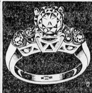
"Sylvia" Three - Diamond Engagement Ring

Large solitaire plus two smaller diamonds. Price