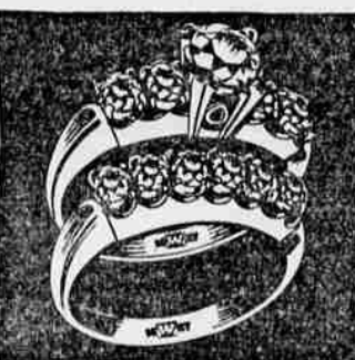
The Glorified "100" 11-Diamond Bridal Pair

Engagement ring has 4 small diamonds, solitaire