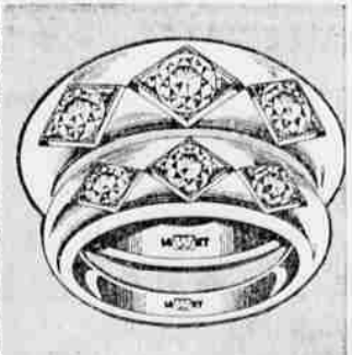
Matched Diamond - Set Gold Wedding Bands

Each wedding band has 3 diamonds across the top.