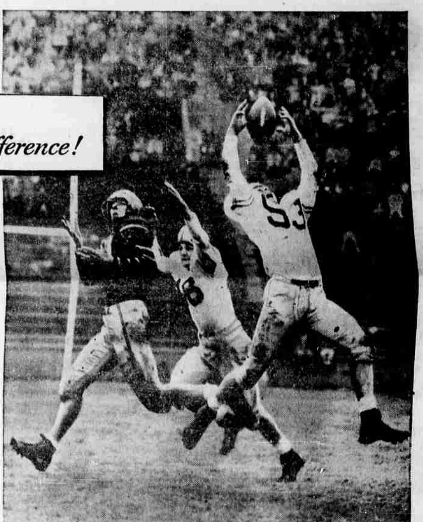
A split second is the big difference in a thrilling pass interception like this. In your engine it's even more important. Unless your engine fires on the right 1/100 of a second, power works against you, not for you.

TCP is the Big Difference between Highest Octane Gasolines — gives you split-second "GO"