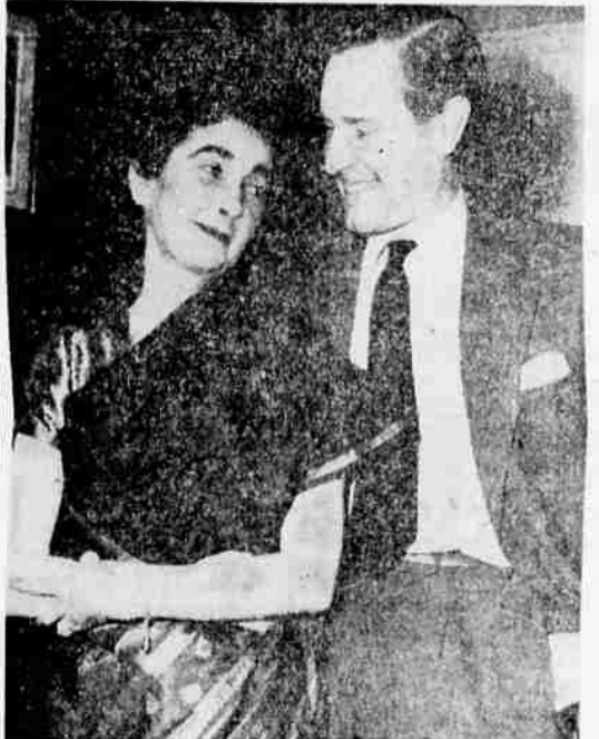
BABS DOES IT AGAIN —Woolworth heiress Barbara (Babs) Hutton was married in Versailles, France, by the mayor to Baron Gottfried von Cramm (right), a German tennis star. It was the heiress' sixth marriage and the baron's second.