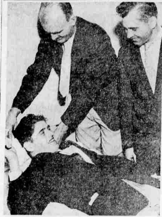
THIS IS THE LIFE —Three ex-turncoat GIs freed from an Army guardhouse enjoy the comforts of a hotel room in San Francisco. The former soldiers who elected to remain with the Communist Chinese after the Korean war won freedom because of Supreme Court decision that said the Army could not try a civilian for crimes committed while in the service.