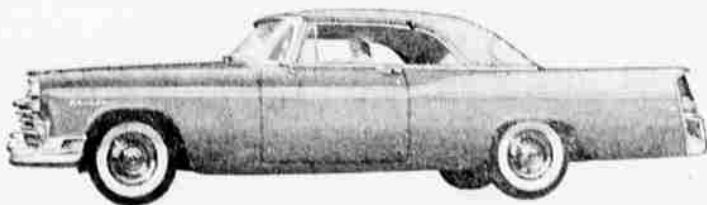
The Chrysler Windsor Newport shows off its 150 hp V-8 power

And if you want more power . . . see the new "PowerStyle" Windsor V-8 with the optional Power-Train that delivers 250 hp and 15% faster acceleration. See the great Windsor V-8 now!