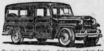
The 'Jeep' Station Wagon... dual purpose vehicle for business and family.