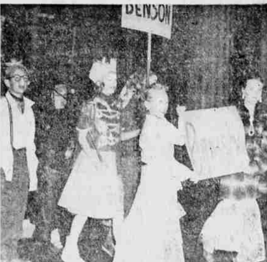
WINNING DELEGATION of youngsters in the parade for biggest percentage of representation in the Jaycee Neewollah Parade with turnout of 107, was Benson which won the trophy for schools over 200 enrollment. The children turned out despite the cold, wet weather, but their elders stayed home. Spectators were few.

PHOTO FINISHING in at 5, out at 9 We give 5¢ Green Stamps CLARK'S STUDIO 105 S. Jackson OR 3-8524