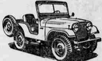
The Universal 'Jeep'... does hundreds of jobs.

New York, N. Y. (Special)—For the first time science has found a new healing substance with the astonishing ability to shrink hemorrhoids and to relieve pain—without surgery. In case after case, while gently relieving pain, actual reduction (shrinkage) took place. Most amazing of all—results were so thorough that sufferers made astonishing statements like "Piles have ceased to be a problem!" The secret is a new healing substance (Bio-Dyne)—discovery of a world-famous research institute. This substance is now available in suppository or ointment form under the name Preparation H. At your druggist. Money back guarantee. *Reg. U.S. Pat. Off.