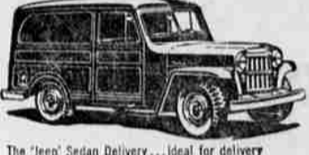
The 'Jeep' Sedan Delivery... ideal for delivery or service use.

4-wheel drive makes them the world's most useful vehicles!