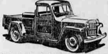
The 'Jeep' Truck... America's lowest-priced 4-wheel drive truck.