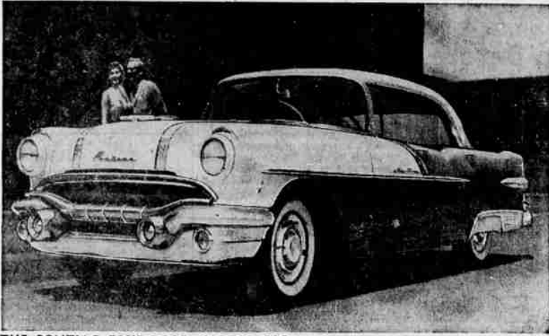
THE PONTIAC FOUR-DOOR HARTOP FOR 1956 is now on display at Roseburg Motors, Rose and Washington Streets, Roseburg. The Star Chief Custom Catalina sedan is finished in custom colors with matching leather and nylon fabric interiors. It has a 124 inch wheel-base and 227 h.p. V-8 engine.