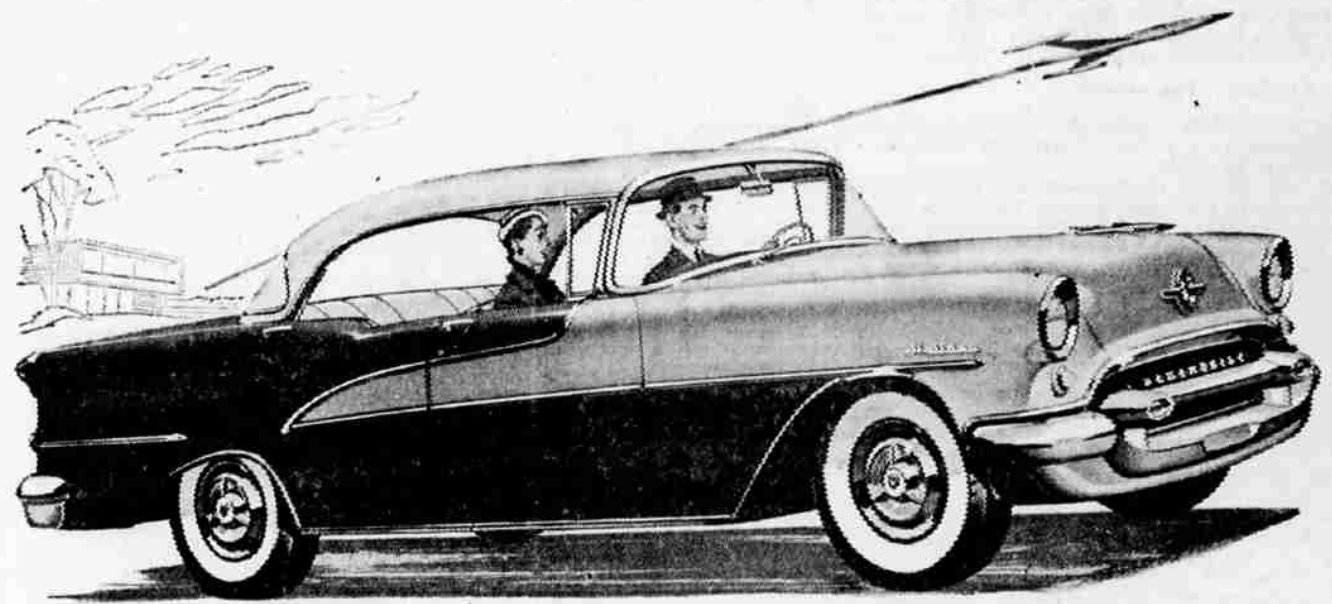
Super "66" Holiday Sedan