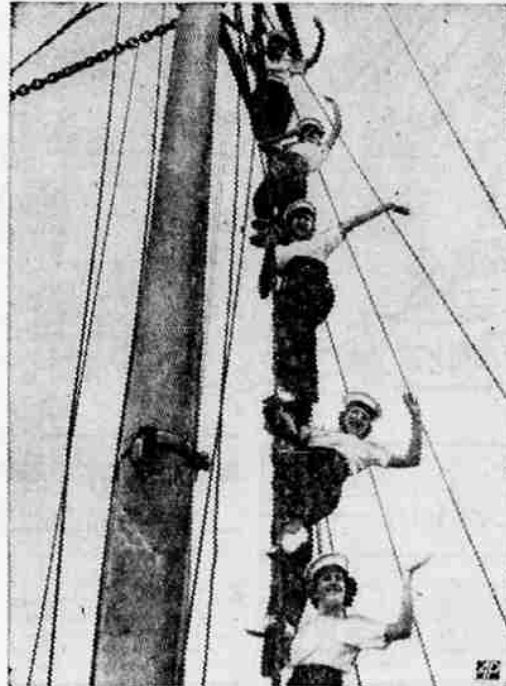
RIGGING DECORATORS —Members of England's Girls' Nautical Training Corps climb rigging of training ship Foudroyant at Portsmouth during review for commandant.