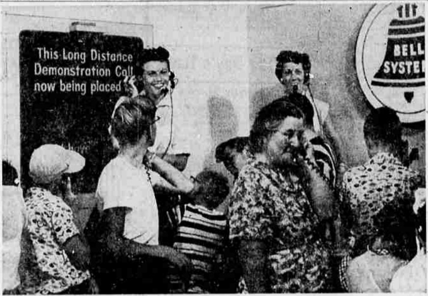
A COMMERCIAL EXHIBIT draws a host of onlookers and listeners for an instructional revelation of the workings of the long-distance telephone call. This booth was one of the favorite stopping places for fair goers Friday.

WINSTON Trailer Sales Next Door to Wag's Furniture Phone OS 9-3101