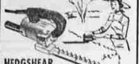
HEDGE SHEAR Model 131

Trims hedges, trees, and shrubs in minutes instead of hours! Precision built, light, easy-to-use. And the razor-sharp teeth trim at the rate of 300 cuts a second! The Hedge Shear does the work... you just guide it. Get professional results impossible with hand shears... and in one-tenth the time!