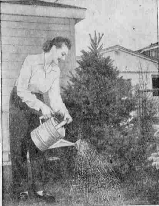
Eliminating weeds from a lawn is not difficult if the grass is sprayed with a solution of water and chemical weed killer. Be careful, though, around evergreens and other desirable plant life. A safe practice is to "spot water" with a galvanized steel sprinkling can, aiming the can nozzle directly at weeds.