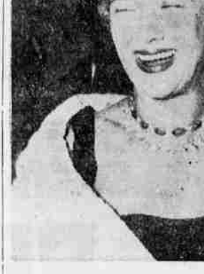
GABLE TRIES AGAIN—Actor Clark Gable and his new bride, the former Kay Williams, ex-actress, married in a surprise ceremony at Minden, Nev. It was his fifth marriage, third for Miss Williams.

The total of mortgage debt outstanding mounts as the housing boom continues most places unchecked. Since the end of the war the amount has increased four fold and crossed the 75 billion dollar mark as 1955 started.