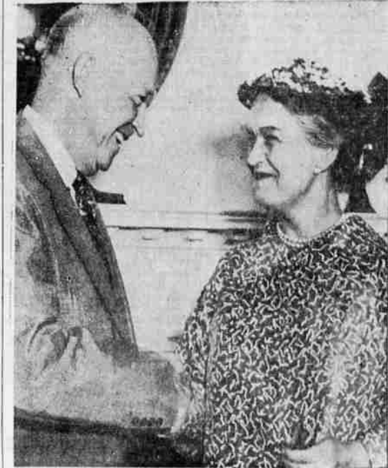
'BEST MAN IN CABINET' — In Washington, President Eisenhower bids goodbye to Oveta Culp Hobby after she resigned as secretary of health, education and welfare. The Chief Executive characterized her as "the best man in my cabinet."

June's toll of 31 dead on Oregon highways brought the six-month tally to 165, compared to 180 for the same period of 1954.