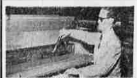
THE TUNER ALONE

About 400 carloads of dandelion greens are shipped to New York and Philadelphia every year.