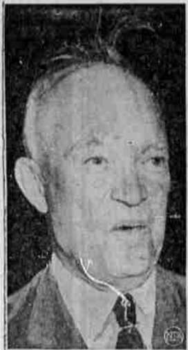
HAIR-RAISING —The wind was blowing in San Francisco and was impertinent enough to whip President Eisenhower's hair into approximation of an Indian topknot. He seems somewhat startled by it all.