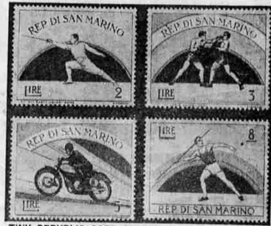
TINY REPUBLIC GOES SPORTY —Sports fans will be interested in these new stamps from the tiny (38 square miles) Republic of San Marino, located near Rimini, Italy. The stamps have a winged wheel watermark.

417 1/2 E. 2nd Ave. S. Phone OR 3-4596 10% DISCOUNT FOR CASH & CARRY