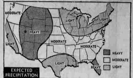
PRECIPITATION from now to mid-July will exceed seasonal normals in the western Mountain and Plateau states. Subnormal rainfall is expected over northeast quarter of nation.

WASHINGTON (AP)—Granted two extra days to file appeals, attorneys in the Hells Canyon case worked on final briefs Tuesday amid a growing belief the long-standing controversy won't be ended before Congress adjourns. Acting at the request of public power attorneys, the Federal Power Commission Monday extended until Wednesday the deadline for an appeal of an examiner's decision on the Idaho Power Co.'s application to build three dams on the Snake River in an area where a single federal dam has been proposed. The briefs were to have been filed Monday. Attorneys who requested the deadline extension also are expected to ask the FPC to postpone oral arguments scheduled for July 6. Meantime, a House interior subcommittee has moved back dates of a hearing on a bill to authorize a federal Hells Canyon dam from June 29-July 1 to July 11-14.