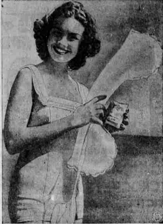
SAVING GRACE —That's not a pack of cigarettes the comely model is holding in her left hand. It's a life preserver, like the one in her right hand. The new 3 1/4-inch by 2 1/4-inch lifesaver was recently demonstrated in Chicago. A squeeze breaks a carbon dioxide cartridge, which inflates a pair of two-foot wide plastic water wings. It is said it will support a 250-pound person in the water for more than 24 hours.