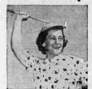
Mildred Didrikson Zaharias, greatest woman athlete of all time, tells her amazing story