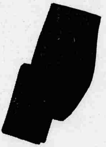
FINER SLACKS . . .

by Champion, Pendleton and Kuppenheimer in the finest of fine wools. Styled for his casual wear . . . dress wear. Latest colors. Gift priced