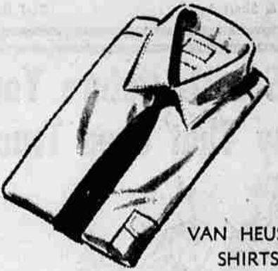
VAN HEUSEN SHIRTS

The collar style that is his favorite . . . the Century. Never wrinkles. Cool to wear. Give him one or two.