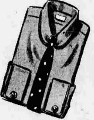
VAN HEUSEN COLORED DRESS SHIRTS . . .

Choose color for dad, give him one of the new fashion colors for men. Maybe MINT in broadcloth or oxford cloth. Many collar styles.