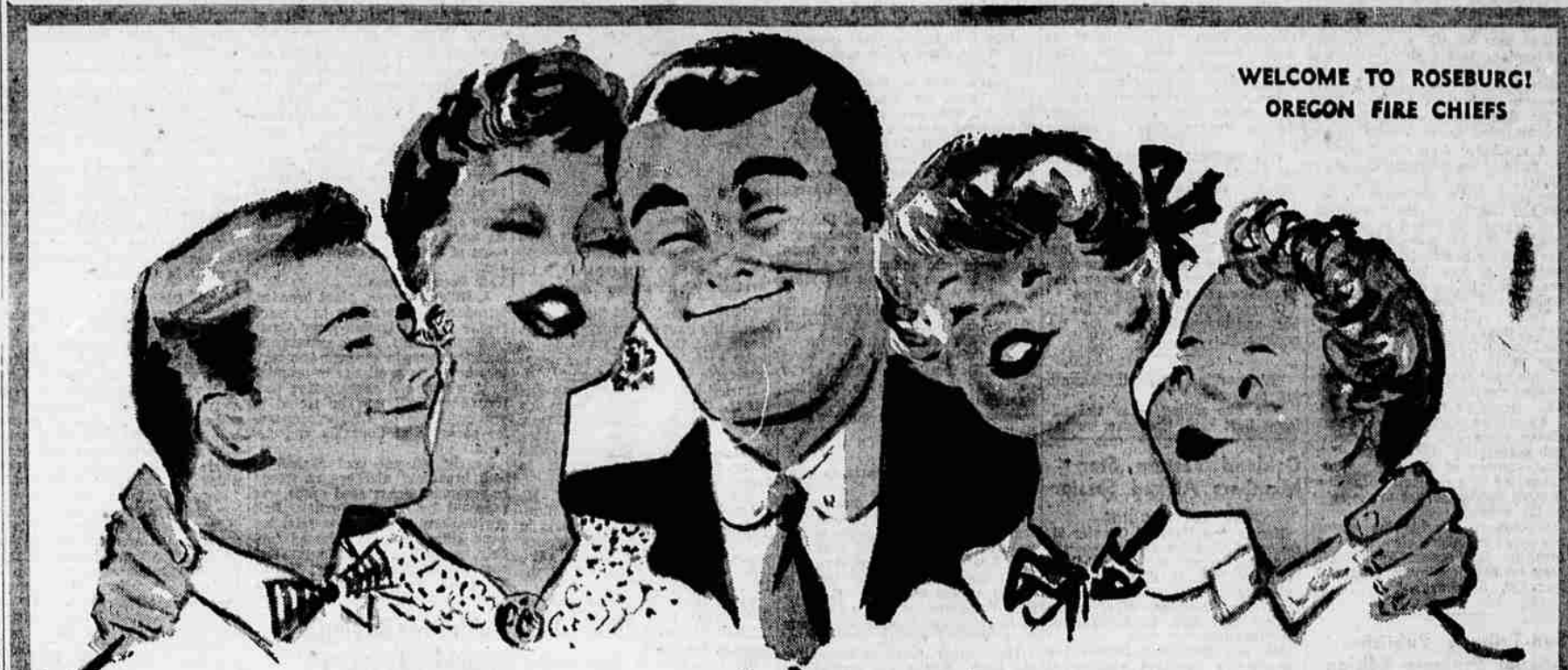
WELCOME TO ROSEBURG! OREGON FIRE CHIEFS