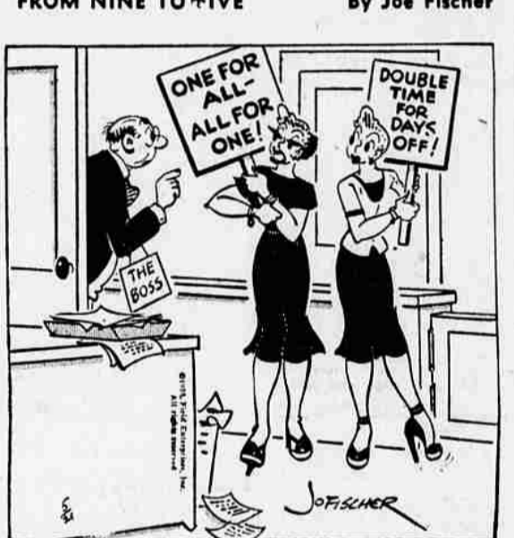
It's a sympathy strike, Mr. Wump. If you won't give us more money, then at least you should give us more sympathy.