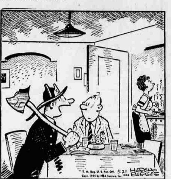
"It's a reminder to keep the wife from burning the steaks!"