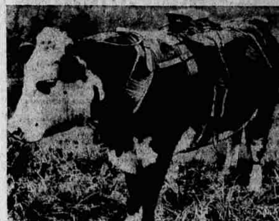
WIRED FOR WEIGHT —This cow in Gateshead, England, is being watched—all the time. The harness on its back holds electronic equipment that records every movement the cow makes—tail swishing, walking, bending and chewing. By determining the number of mouthfuls of grass that goes to each pound the cow gains, scientists hope to discover which type of grass does the best job of fattening cattle.