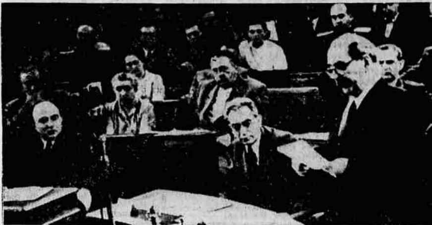
EXPULSED —Ailing Hungarian Premier Imre Nagy (right) was dismissed from office and expelled from his Communist Party posts. Nagy was accused of putting consumer goods ahead of heavy industry, same charge that brought about downfall of Soviet leader Georgi Malenkov. Succeeding Nagy was Andras Hegedues (far left), former agriculture minister. Above, the latter listens as Nagy delivers inauguration speech at Budapest in 1953.