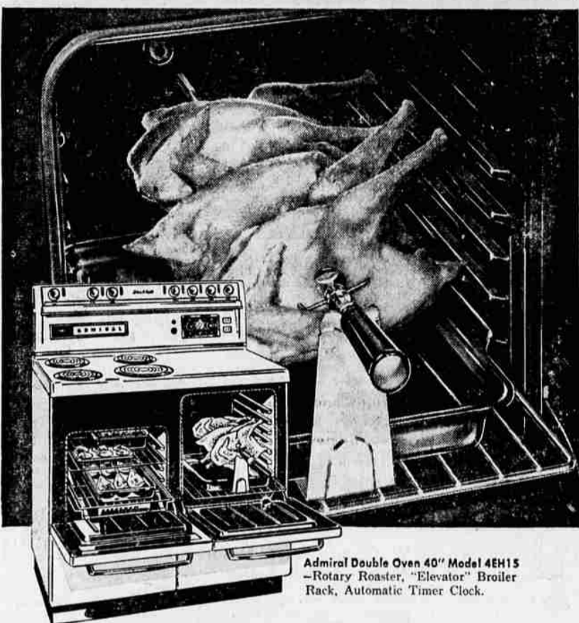
Admiral Double Oven 40" Model 4EH15 —Rotary Roaster, "Elevator" Broiler Rack, Automatic Timer Clock.