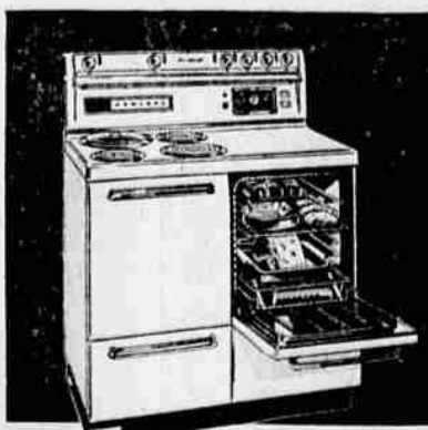
Admiral 40" Deluxe Model 4EH12—Deep Well Cooker, many other features!

Admiral Electric Ranges fit every need and budget