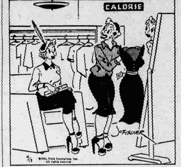
It's the most wonderful way to reduce. I buy a very expensive dress . . . then for weeks I can't afford to eat.