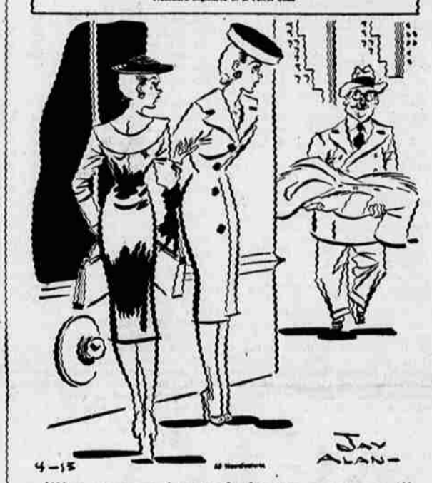
"Here comes my favorite fur bearing creature now!"