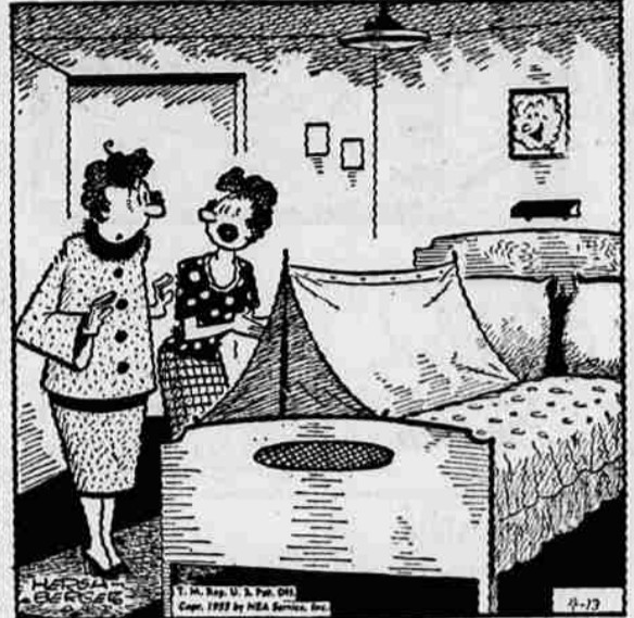
"Joe put it up—he claims I take all the covers when I roll over!"