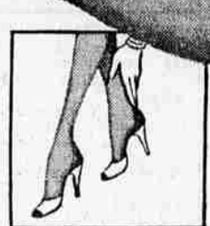
WILL NOT SAG AT ANKLES

135 PAIR in 3 sizes that fit every leg perfectly