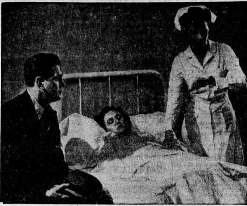
HOSPITAL BOARD AND ROOM