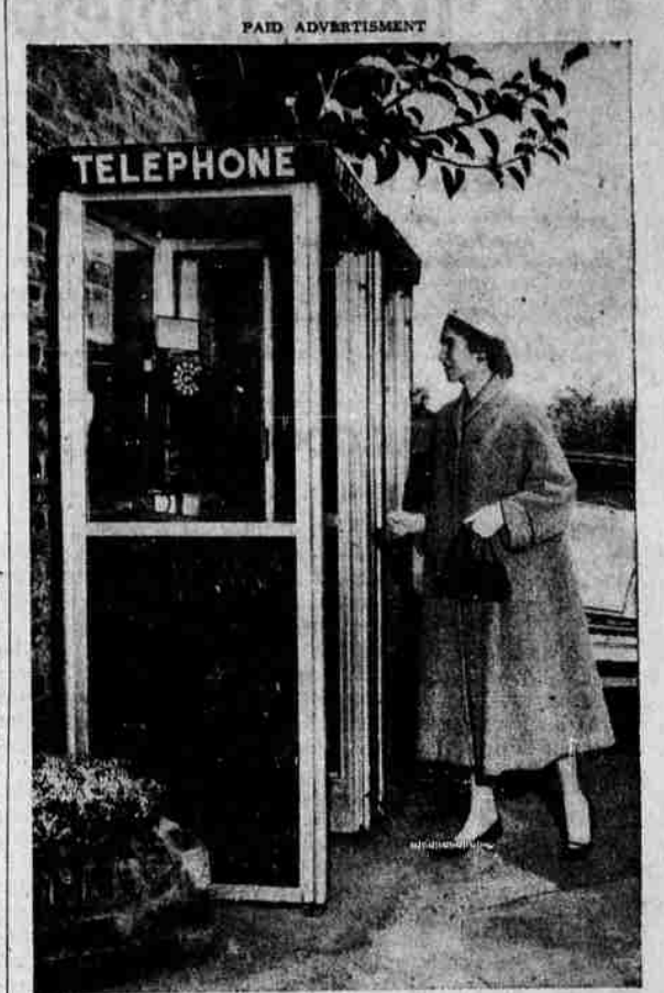
Outdoor telephone booths get new look. Instead of wood, these new models have silvery-white aluminum frames, with big glass panels. They're larger, have better lighting and ventilation. These booths are more convenient to use... cost less to take care of... last longer. They help us bring you more and better telephone service. Pacific Telephone works to make your telephone a bigger value every day.