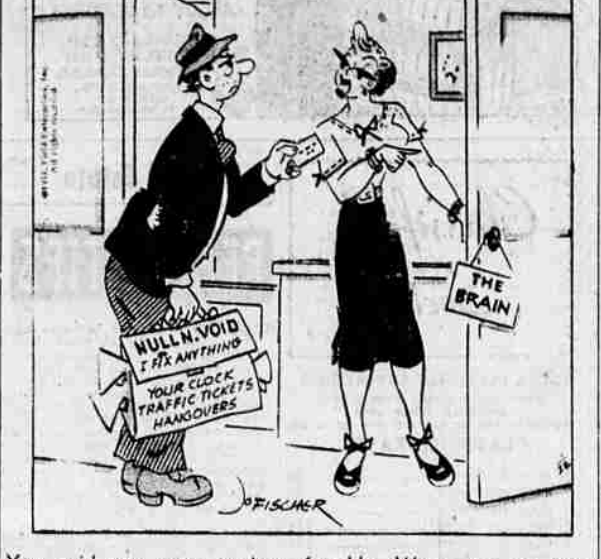
You said you were anxious for Mr. Wump to see you. Well, he did... he peeked through the keyhole.