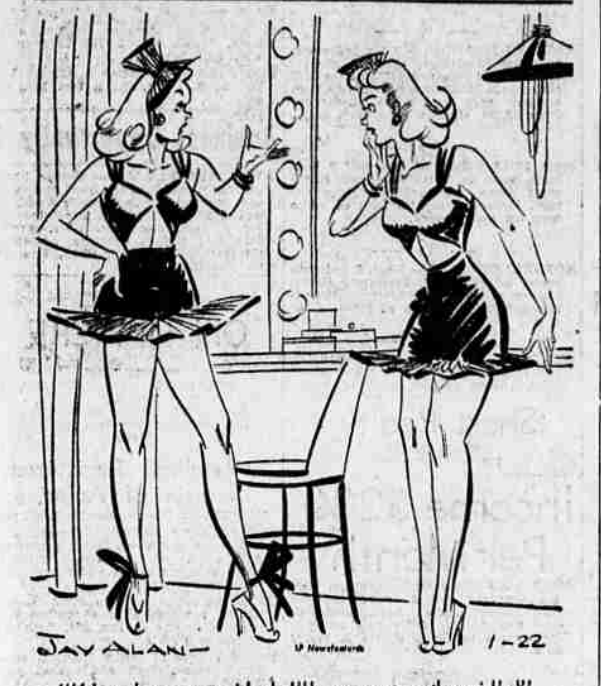
"If I can't marry my ideal, I'll marry some other girl's!"