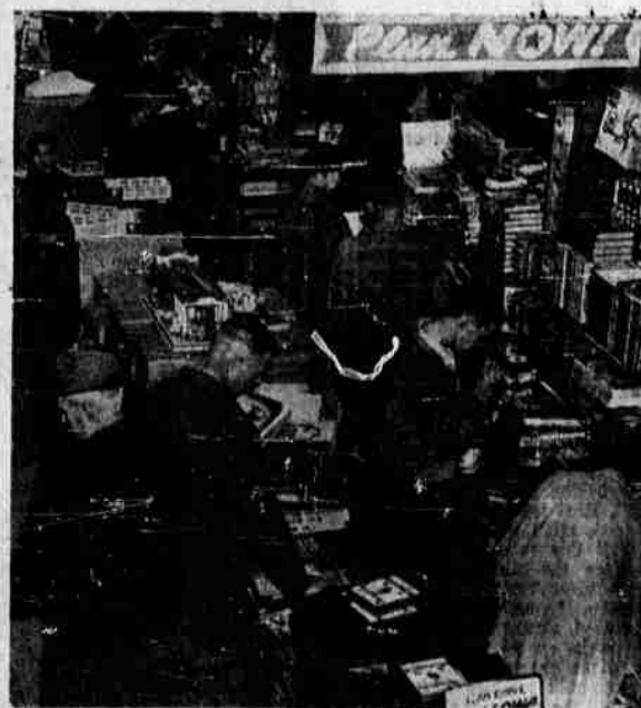
FORTUNATELY Santa has lots of help selecting presents. His willing assistants crowded the aisles of Pay Less Drug in the picture above.