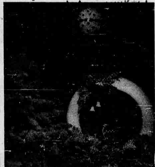
STORES AND WINDOWS were full of pretty and fanciful Christmas decorations. Those shown above are from Umpqua Florists.