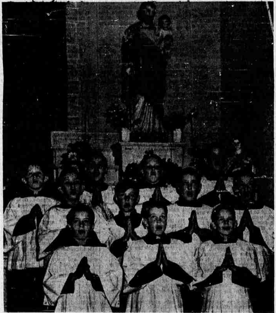
ST. JOSEPH'S ALTAR BOYS sing Holy Night. The picture is a reprint—the little boys are young men now.

Once again the Eagles, and Moose Lodges in Roseburg and the Winston-Dillard Fire Dept. have collected broken and discarded toys to repair and distribute to underprivileged children. Santa's helpers have been pounding and painting for a month in a race against time, always working with the vision of some child in mind who might NOT receive a gift from Santa.