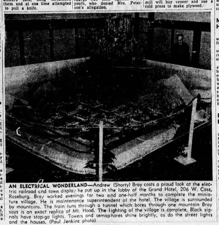
AN ELECTRICAL WONDERLAND—Andrew (Shorty) Bray casts a proud look at the electric railroad and town display he put up in the lobby of the Grand Hotel, 206 W. Cass, Roseburg. Bray worked evenings for two and one-half months to complete the miniature village. He is maintenance superintendent of the hotel. The village is surrounded by mountains. The train runs through a tunnel which bores through one mountain. Bray says it is an exact replica of Mt. Hood. The lighting of the village is complete. Block signals have stop-go lights. Towers and semaphores shine brightly, as do the street lights and the houses.

By L. F. Reizenstein Ergo, socialized medicine is coming, and consumption of apples "to keep the doctor away" will probably concurrently decline.