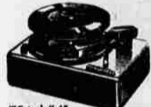
"Victrola" 45 Automatic Record Changer Attachment—Plugs easily into any radio, phonograph or television set for a fine combination. Model 4512.