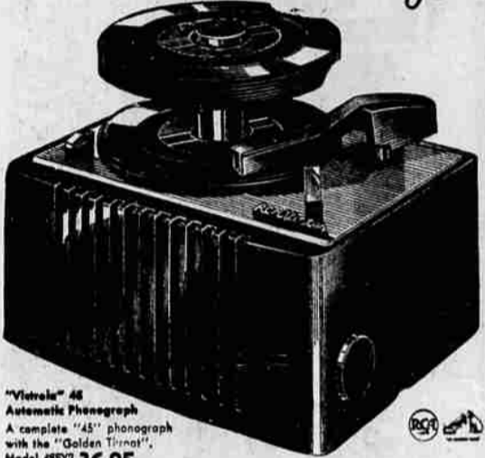
"Victrola" 45 Automatic Phonograph A complete "45" phonograph with the "Golden Tone" Model 45E12 $36.95

With Extended Play Records on "Victrola" 45