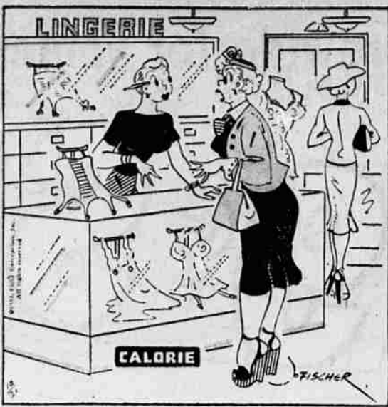
What have you got that will take the place of a diet?