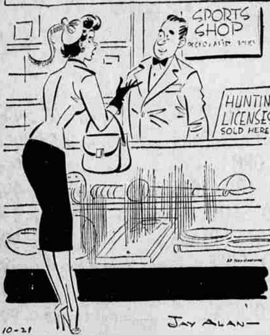
"I WANT A LICENSE FOR TYCOON HUNTING!"