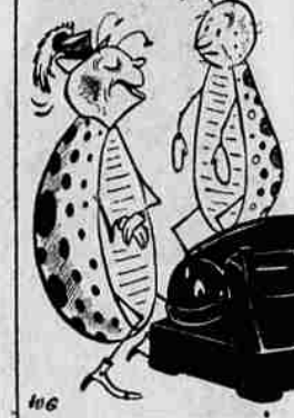
"Of course I space my calls so others have a chance to call. I'm a lady... bug!"