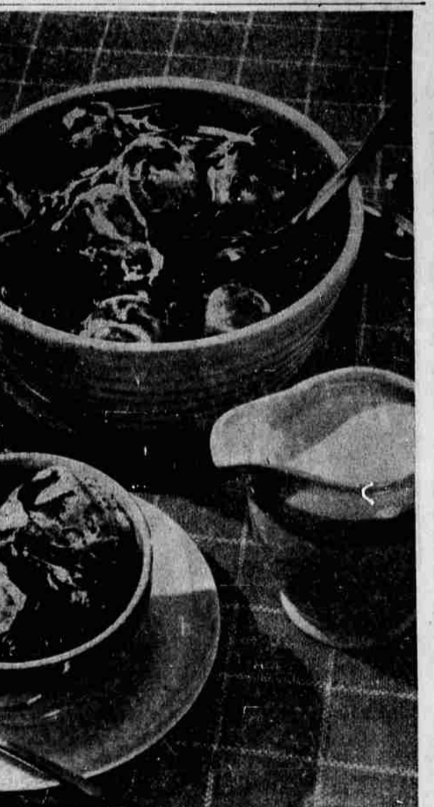
HERE'S A REALLY NEW IDEA —If they like pudding cold, they'll love it hot! Dishes of warm chocolate pudding, touched with white by the lightly melted marshmallows... try this and watch eyes light up and smiles grow warm!

Vary the fruit you serve for breakfast by including dried and canned as well as fresh and frozen. The new way many folks are fixing prunes these days is to put some prunes in a jar and cover with boiling water. Let stand 48 hours in refrigerator.