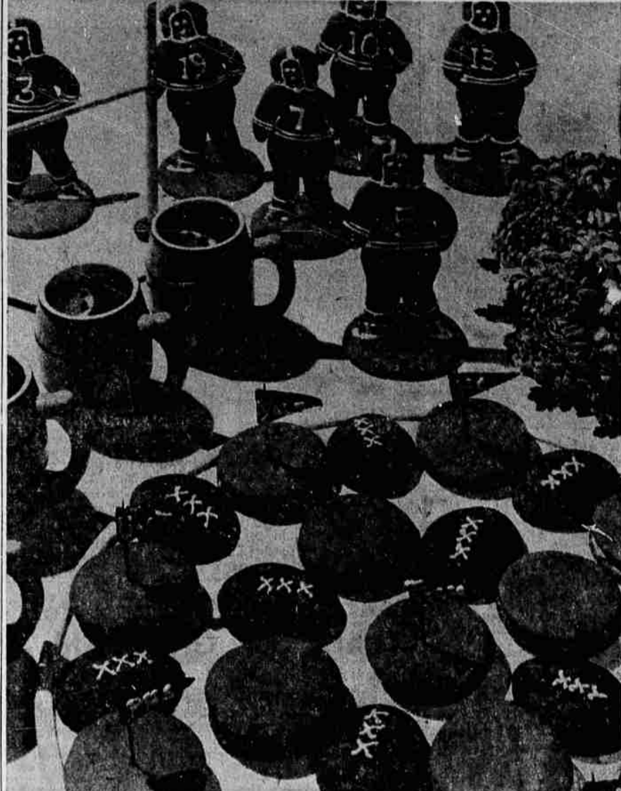
NO ONE WILL LOSE when the team descends on the after-the-game table filled with these delightful little football men. The gingerbread boy has donned a helmet and has joined the team of goodies that grace such a table. He is surrounded by footballs and pennant flags to complete the theme, so now it's up to you to blow the starting whistle for good eating.

Combine sugar, cocoa and salt in saucepan; blend in coffee. Cook over low heat until smooth and glossy, stirring often (about 15 minutes). Cool. Beat in nutmeats and vanilla. Chill until firm. Spread on cake with spatula dipped in hot water. Makes enough frosting for 24 tiny cup cakes or top and sides of two 8-inch layers.