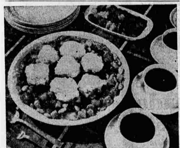
WANT SOMETHING HEARTY after a nippy afternoon spent at the game? Then stewed beef with Herb Dumplings is the dish for you. This will warm you to the tips of your chilled toes.

Note: If cookie "stands" are desired, double the recipe. Cut out