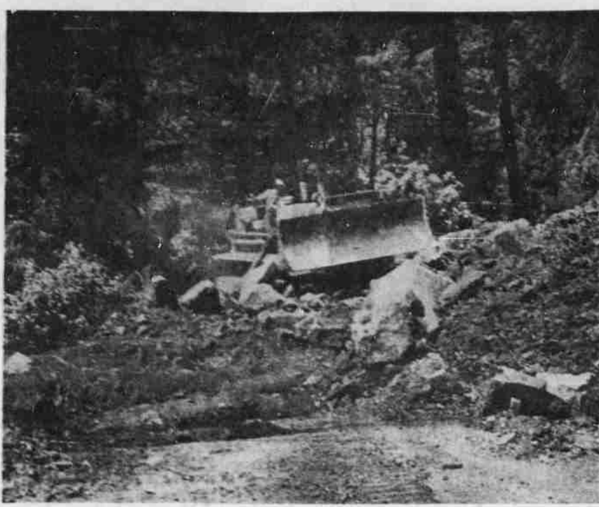
DELAY AHEAD —Motorists on the North Umpqua Highway between Steamboat and Apple Creek may be confronted with a scene like this during the next few months. The road, where construction is being handled by the Bureau of Public Roads for the Forest Service, will be closed periodically each day through the remainder of the summer. The terrain offers no opportunity for a detour route, so travelers may have to wait at certain times when blasting or grading are under way. The roadwork will be a boon to the Umpqua Valley, however, because of better access to timber.

Youngsters will register in Room 2 of the junior high school.