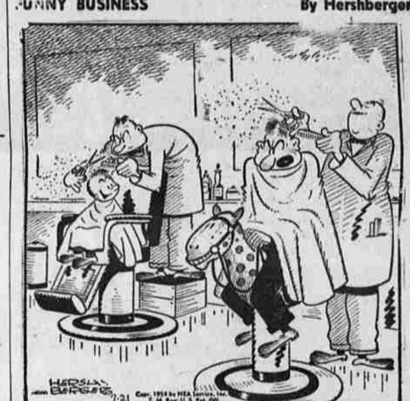
"That's kids for you! They always hafta do things different!"