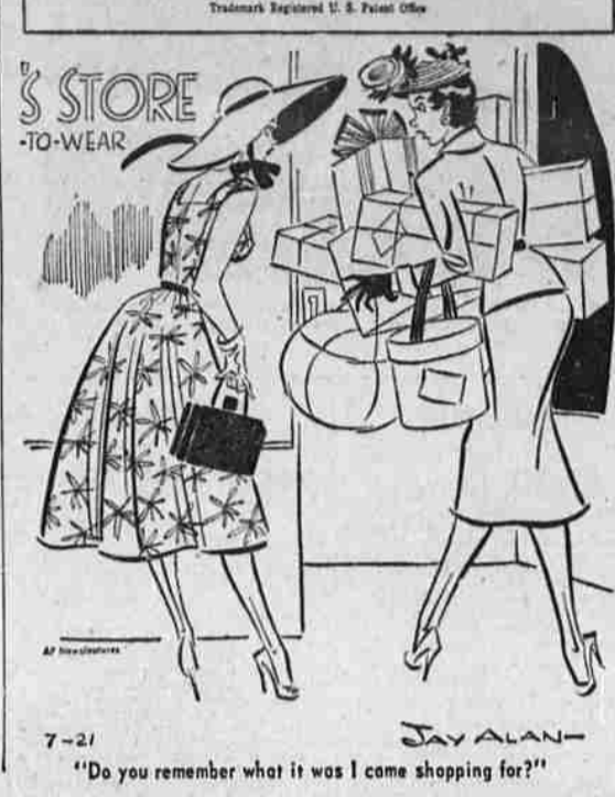
"Do you remember what it was I came shopping for?"