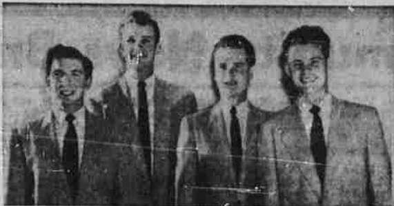
AMBASSADORS, 1954 edition , will appear at the North Roseburg Church tonight in a concert of hymns, spirituals, and novelty numbers which they will present in conjunction with a brief message. The group is currently on tour of western cities.