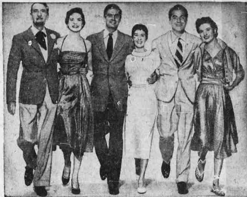
DELIGHTING AUDIENCES at the Indian Theatre where it is now showing through Saturday, "Three Coins in the Fountain", newest of the Cinemascope productions to play Roseburg, has (l. to r.) Clifton Webb, Dorothy McGuire, Louis Jourdan, Maggie McNamara, Rossano Brazzi and Jean Peters in top roles of the romantic comedy.