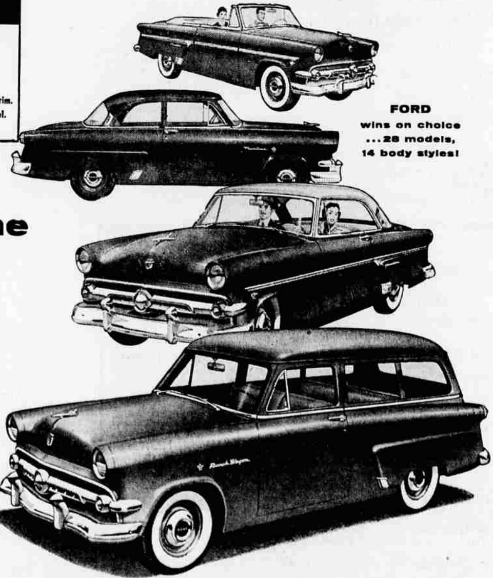
FORD wins on choice... 28 models, 14 body styles!

Ford wins on the "deal," too! Come in and get the score Today!