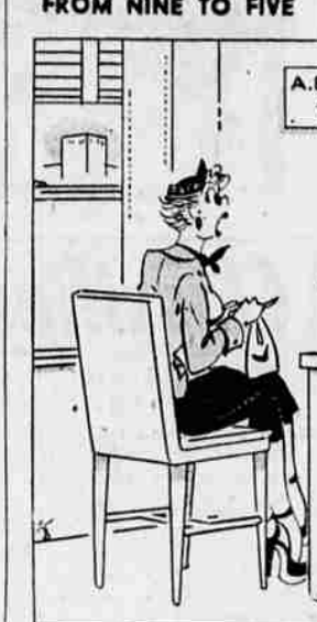
Oh yes, I got wonderful references wherever I worked. You see, I was always fired for the good of the firm.