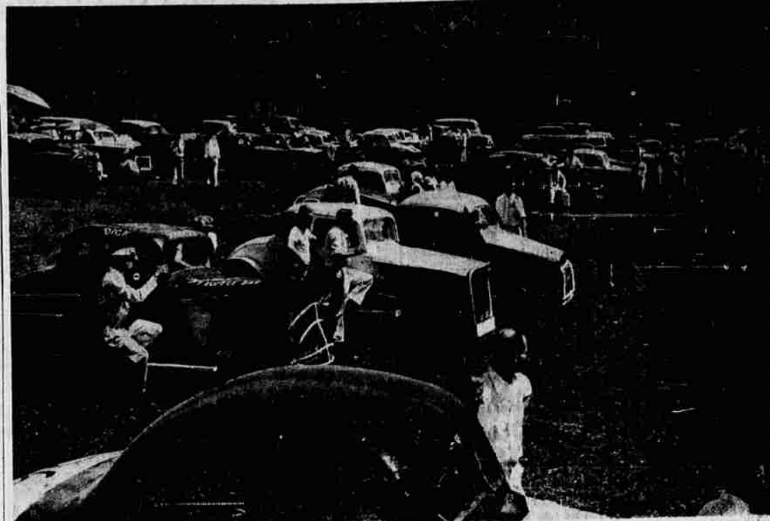
HARDTOPS LINED UP IN ROSEBURG SPEEDWAY PIT will go into action for season's second program at track tonight beginning with time trials at 7 p.m. Over 40 cars are expected to take part in seven-event program which includes trophy dash, four heat races, and A & B main events. (Charles Kash Photo).

Thursday's Results Los Angeles 8, Seattle 3 Oakland 6, San Diego 3 Hollywood 6, Sacramento 1 San Francisco 5, Portland 3