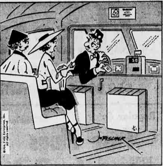
We have just the exact fare... but pretend there's more and keep the change.