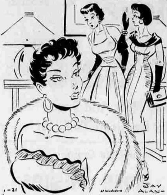
SHE HAS A GRECIAN PROFILE, ITALIAN HAIRCUT, PARISIAN DRESS, RUSSIAN SABLE, AND AN AMERICAN MILLIONAIRE!!