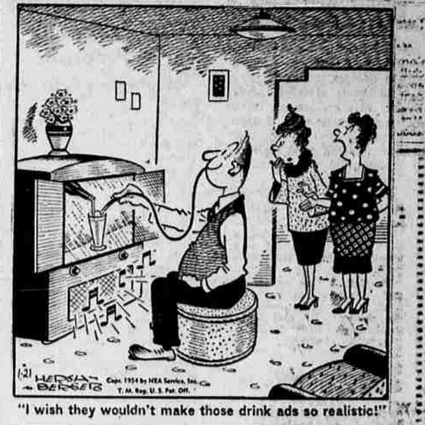
"I wish they wouldn't make those drink ads so realistic!"