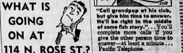
"Call grandpop at his club, but give him time to answer. He'll be right in the middle of some fish story..."