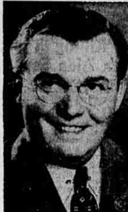
IN NEW JOB —Sen. Thomas A. Burke, Democrat, is Ohio's newest member of Congress. A former mayor of Cleveland, Burke was appointed to take the Senate seat formerly held by the late Sen. Robert A. Taft.