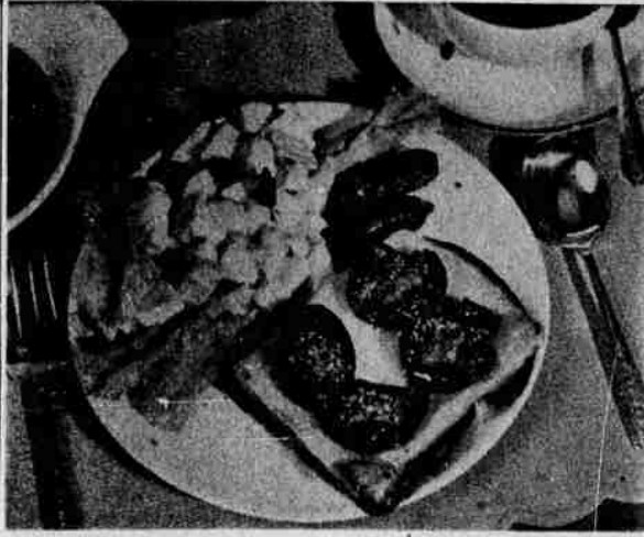
TOASTED Fig 'n' Cheese Sandwich is nourishing.