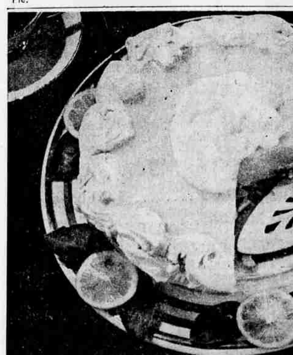
DELICATE party dessert is Angel Crust Lemon Pie, pretty and festive to serve when you have guests for dessert-and-coffee.