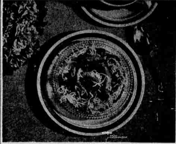
AMBROSIA combines dried figs with oranges.