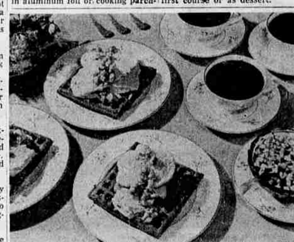
SCOOPS of coffee ice cream top these Chocolate Waffles for dessert.

Dribble honey over prepared grapefruit halves; sprinkle lightly with cinnamon; broil. Good as a first course or as dessert.