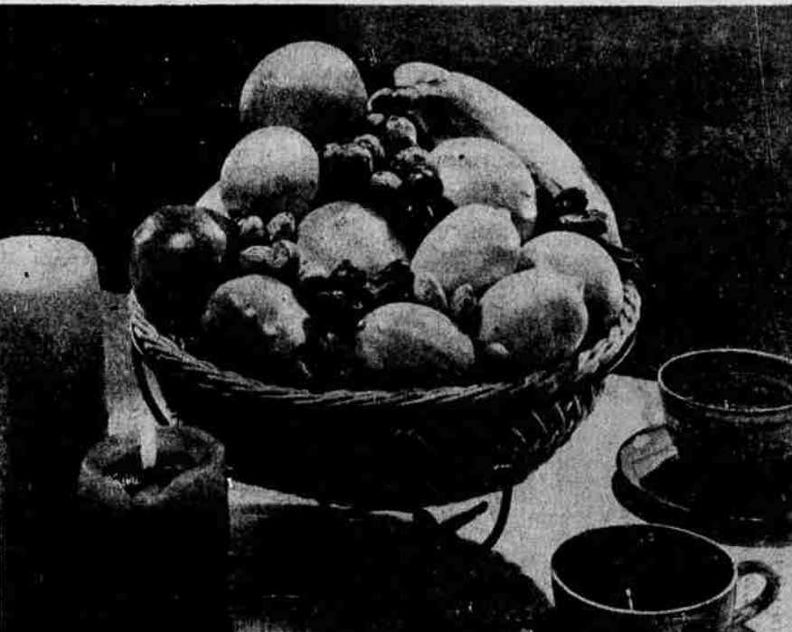
DECORATIVE centerpiece for your dining table, buffet or sideboard, lemons and oranges blend with other fruits arranged in a bowl or basket.

in lemon juice and roll in coconut. Arrange orange slices in 4 groups on garnished serving plate. Top with peach slices. Heap banana chunks in center of plate. Garnish with cherries. Serves 4.