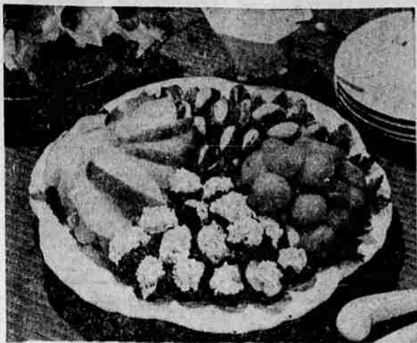
FRUIT SALAD features versatile Brazil Nuts.