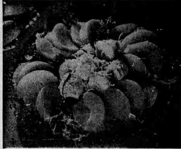
PEACH SLICES make an all-season salad.