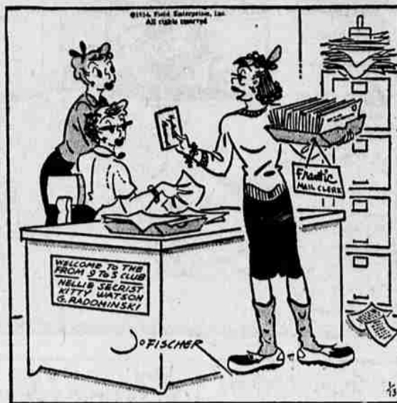
All it had on it was your name and "personal" but I wasn't sure who it was for... so I read it.