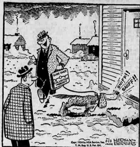
"He's a new kind of pointer—he spots delinquent accounts when they move from one place to another!"