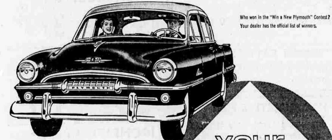
Who won in the "Win a New Plymouth" Contest? Your dealer has the official list of winners.

3 then tell us which of Plymouth's beautiful new models you prefer and how you'd like to pay. We'll work out a deal that will be easy on your pocketbook!