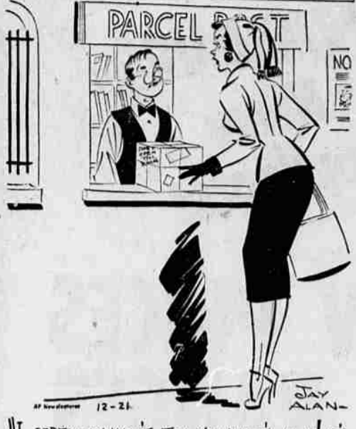
I CERTAINLY WON'T TELL YOU WHAT'S IN IT! IT'S A SURPRISE!