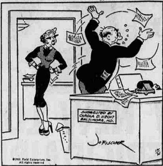
If I drive you dizzy just being around here, Mr. Wump, why don't you stay home on those days?