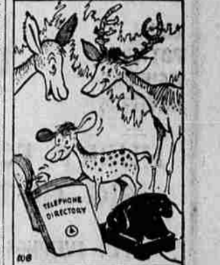
"Isn't he a little dear! Always makes sure of the correct number before he calls! ... Be sure to look up numbers you're not sure of... before you make telephone calls. You'll save time and avoid wrong numbers!... Pacific Telephone."