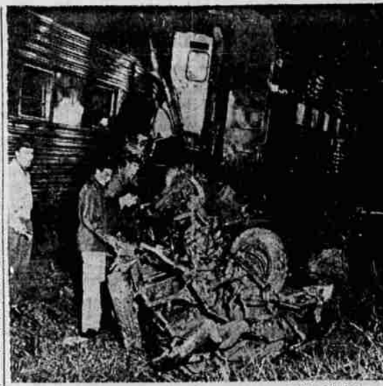
AUTO DERAILS STREAMLINER —Bystanders examine wreckage of auto which collided with the crack Texas Special streamliner at a grade crossing near Royse City, Tex., killing all six occupants of the car. Eight of the train's 14 cars were derailed, but no one on it was seriously injured.