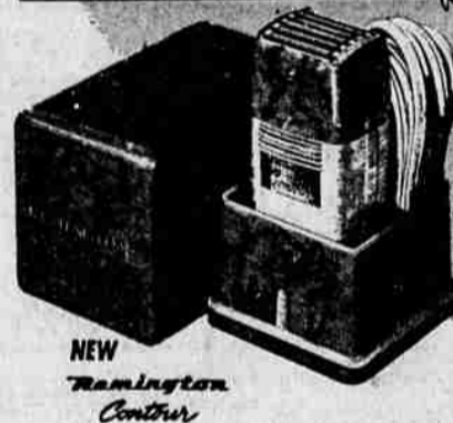
NEW Remington Contour

Must shave you close as a blade or your money back!