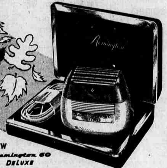
NEW Remington 60 DELUXE