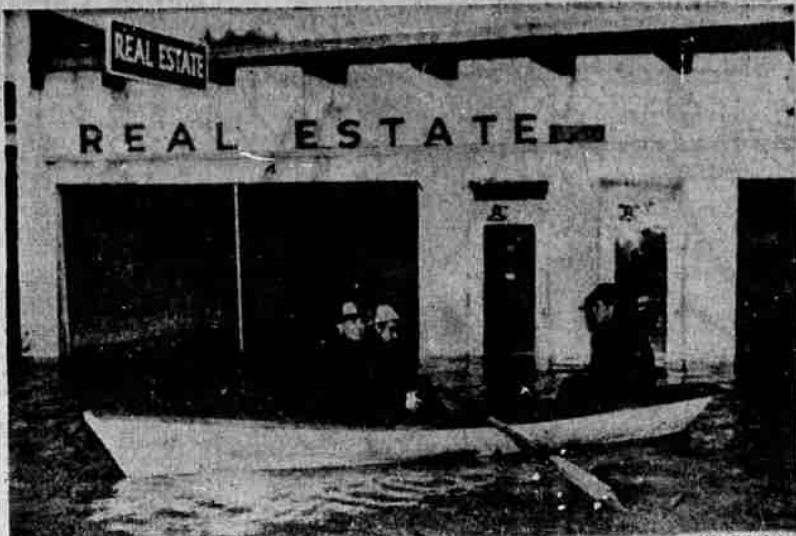
SUBMERGED — Although mindful of the dampness, these three Fortuna, Calif., residents manage to smile as they row by a submerged real estate office on the town's main street. Hundreds are homeless and six are dead as the result of four flooding rivers in Northern California and Southern Oregon.