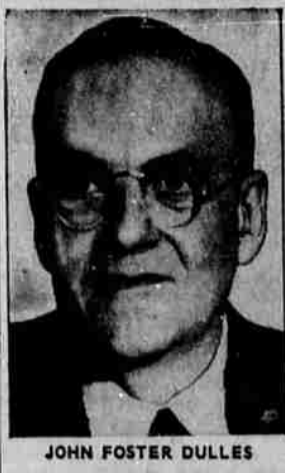
JOHN FOSTER DULLES